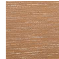
Patio 1 Oasis Pumpkin