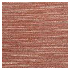
Patio 1 Oasis Rust