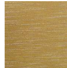
Patio 1 Oasis Yellow