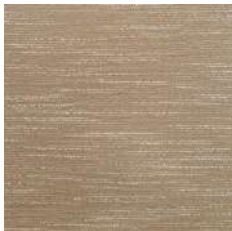
Patio 1 Oasis Tan