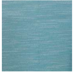
Patio 1 Oasis Turkis