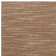
Patio 1 Oasis Brown