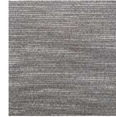
Patio 1 Oasis Beige