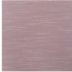
Patio 1 Oasis Salmone