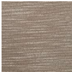
Patio 1 Oasis Bark