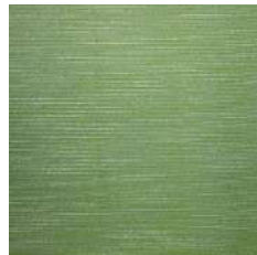
Patio 1 Oasis Pistachio