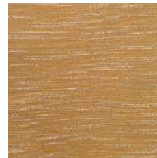
Patio 1 Oasis Pawpaw