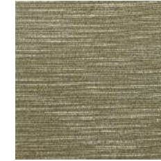
Patio 1 Oasis Muschio