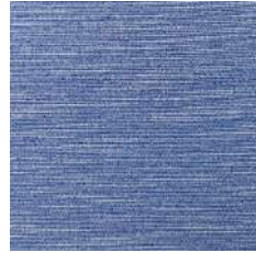
Patio 1 Oasis Notte